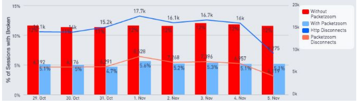
Last Mile Connection Rescue - 52% with PacketZoom

Since PacketZoom leverages UDP as a transport protocol, using the solution also increased the number of successful API calls thanks to the high connection rescue rate (52% or 112,000 sessions per week).